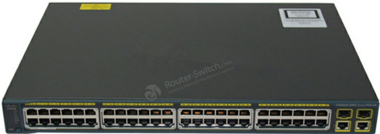
Table 1 shows the Quick Spec of the WS-C2960-48PST-L.

Figure 1 shows the appearance of the WS-C2960-48PST-L.